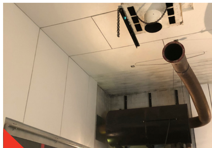
Flexshield Calando Panel